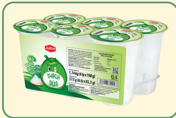
CUP 90G OR 190G Block = cup x 06