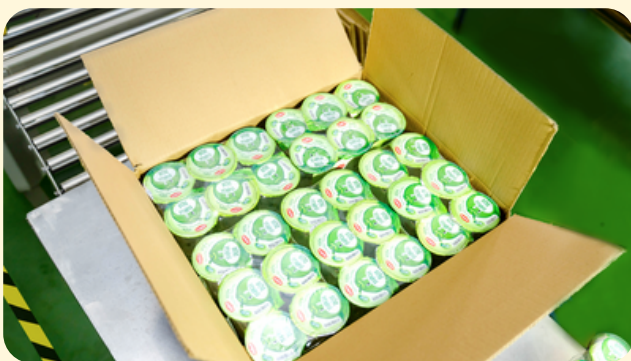
CARTON BOX 8-10KG