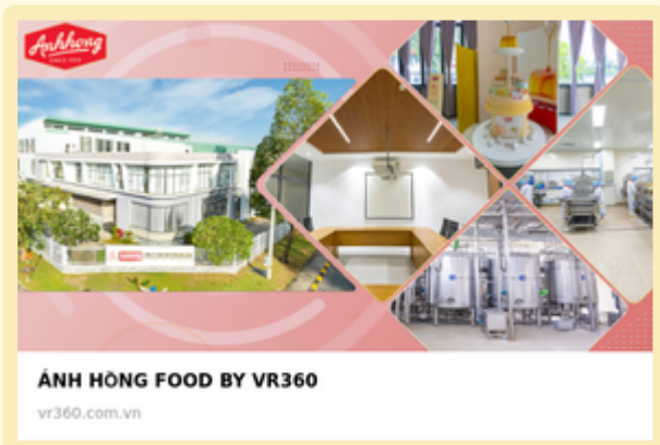
ANH HONG FOOD BY VR360 vr360.com.vn