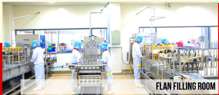
FLAN FILLING ROOM

Mixing raw material with freshmilk, fermentating, concentrating, refrigerating and then packaging