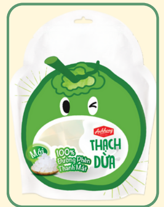
BAG 400G OR 900G